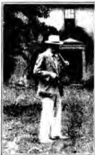
(4) CECIL SHARP PLAYING PIPE AND TABOR